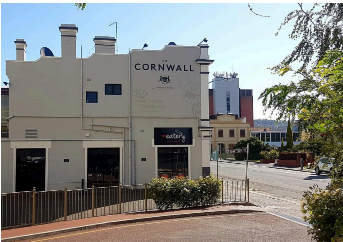
The Cornwall Hostel, Launceston, Tasmania