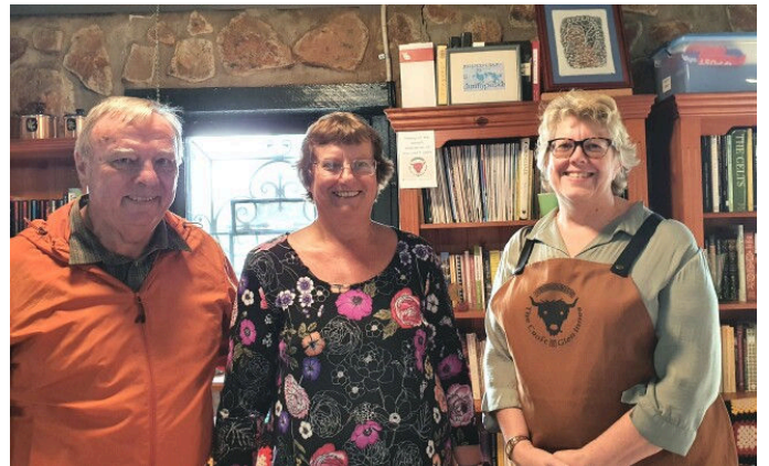
Our Library on the shelves behind us